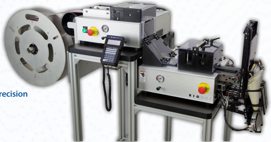
Cutter with roll feed and bottle collection